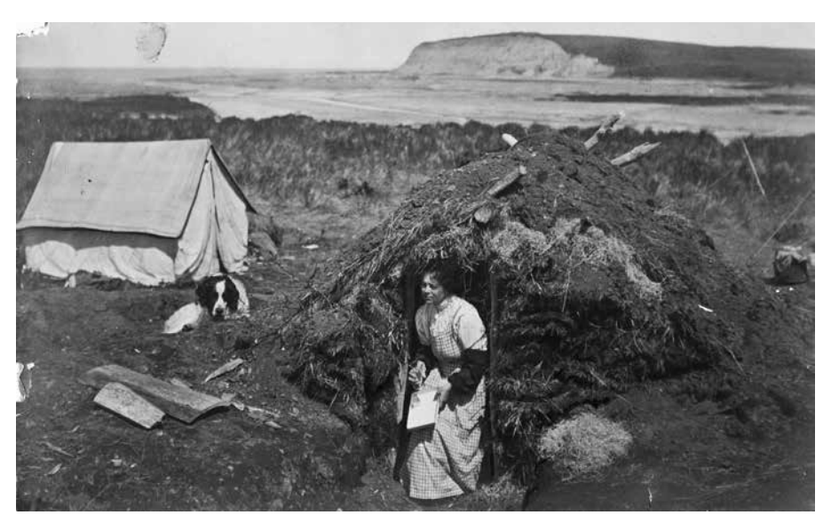
Fig. 3 Dina Jochelson-Brodskaia in front of a native sod-covered hut, summer 1900. Image #337626