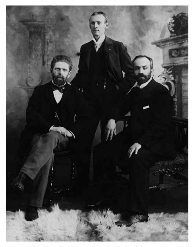
Fig. 1 Waldemar Jochelson, N.G. Buxton, and Waldemar Bogoras in San Francisco before their departure for Siberia, spring 1900.

after him— Evotomys jochelsoni, sp. nov. (Kolyma red-backed mouse; Allen and Buxton 1903:148). The most informative part of the Buxton papers, for our purposes, is his diary. It provides a clearer picture of the course and conditions of their journey, even though the two men traveled apart from each other most of the time (Allen and Buxton 1903:104–119).